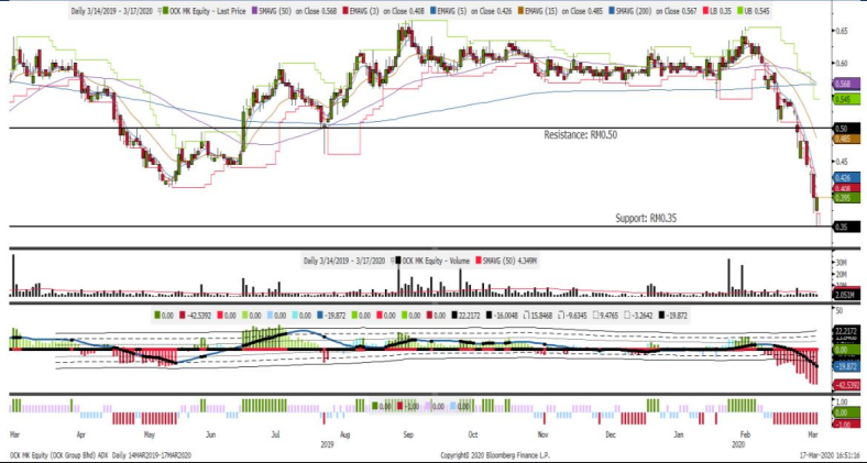
Figure #1 OCK daily: Significant drop and oversold, could be due for technical rebound

Under this negative trading sentiment amid the ongoing Covid-19 episode, most of the stocks have taken significant beating and we may see some potential recovery in certain stocks. In the telco sector, we noticed Perikatan Nasional (PN) commented that the NFCP, budgeted at RM21.6bn will proceed and the plans of rolling out 5G in 3Q are on schedule. Hence, it may be decent for traders to pick up some short term opportunities within telco stocks after a significant fall recently. OCK could be fitting the bill at this juncture as it has formed a hammer candle after declining 47% from the recent peak of RM0.65. Resistance is at RM0.425-0.45, followed by RM0.50. The support is set along RM0.365-0.37, while cut loss is located around RM0.35.